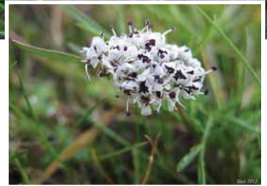
Above, the first grass widow spotted in 2013, and at right, a very early salt-and-pepper lomatum .